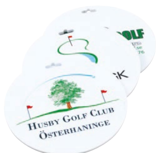
Ø 92 mm

With digital print you get great possibilities to create a personalised and varied print, even in smaller editions. Design your own bag tag for the annual corporate golf event, for the participants to collect.