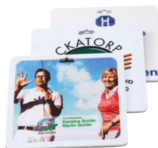
89 x 89 mm